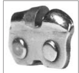
PATENT NUMBER 5,056,395

And of course, when the BULLET® Chain gets dull or cutters are broken it can be repaired and sharpened quickly and inexpensively by Edge Industries or your local Cutters Edge dealer.